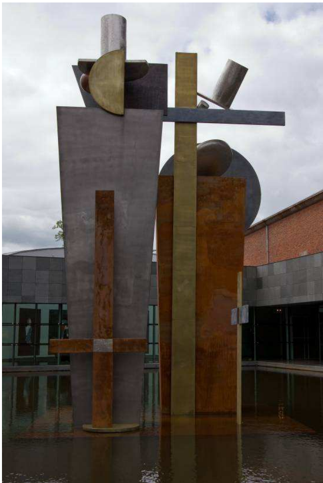
Gravediggers , after design by Lissitzky, Van Abbemuseum, 2009.

Equally spectacular is the eye-catching Gravediggers sculpture, which has been standing more than eight metres tall in the museum's lake since 27 August 2009. It was constructed using various types of metal.