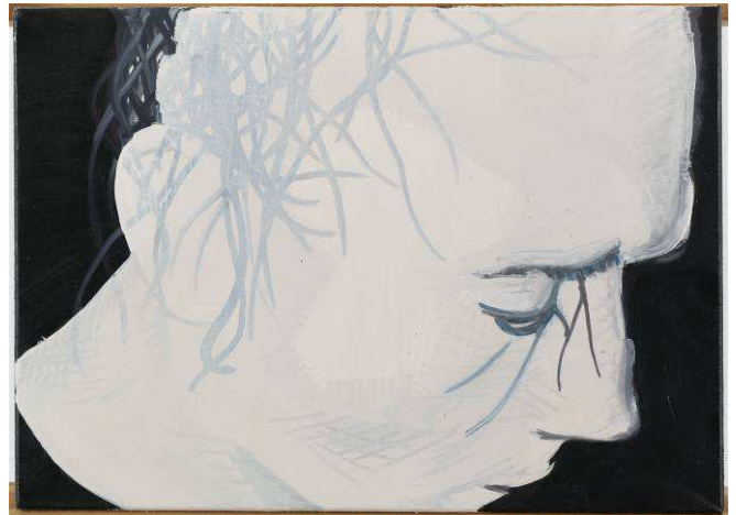
Wilhelm Sasnal, Wojtek , 2005.

The closing act of Part 1 of Play Van Abbe will be performed by the curatorial platform If I Can't Dance, I Don't Want To Be Part of Your Revolution . From 8 until 21 March 2010 they will present the project Edition III - Masquerade at the Van Abbemuseum, simultaneously concluding their long term project Masquerade with this fourth and final episode. Serving as an 'interruption' into the programme of Play Van Abbe, Edition III - Masquerade temporarily interrupts the exhibitions regime with a presentation by six invited artists. The presentation at the Van Abbemuseum, curated by Frederique Bergholz and Annie Fletcher, consists of a series of new performances and projects by Keren Cytter, Jon Mikel Euba, Olivier Foulon, Suchan Kinoshita, Joachim Koester and Sarah Pierce. Edition III - Masquerade will culminate in a performance event during the weekend of 20 March 2010. During this event, If I Can't Dance... receives the keys to the museum for 24 hours and will temporarily take control of the museum.