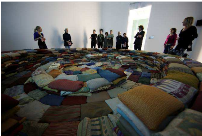
Installation view Strange and Close , 2009.