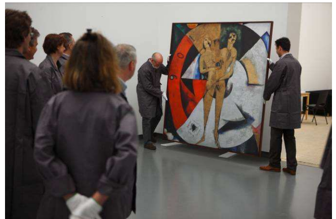
Workshop Replica museum ( F for Fake ), Van Abbemuseum, 2009.

In this project, which focuses on the business world, the participants work in teams on life-size copies of some of the top pieces in the Van Abbemuseum collection. Together they think of and present an exhibition in one of the halls of the museum. This workshop stimulates teamwork, creative thinking and presentation skills and activates all the senses. At the moment the replica museum consists of twenty smaller and larger works from the different periods of art history in the twentieth century. The aim is to expand this number to fifty in 2010. In 2011 and 2012 there are plans for another fifty.