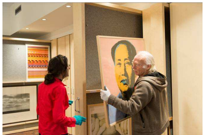
Visitor working with the DIY archive

The Broodthaers exhibition in the library of the Van Abbemuseum displays more than seventy books and works on paper from the collection of the collector